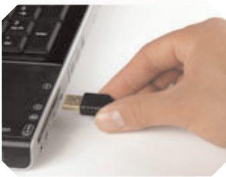
Straight digital output