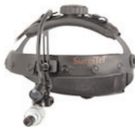
For use with or without loupes