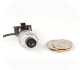
Small and lightweight